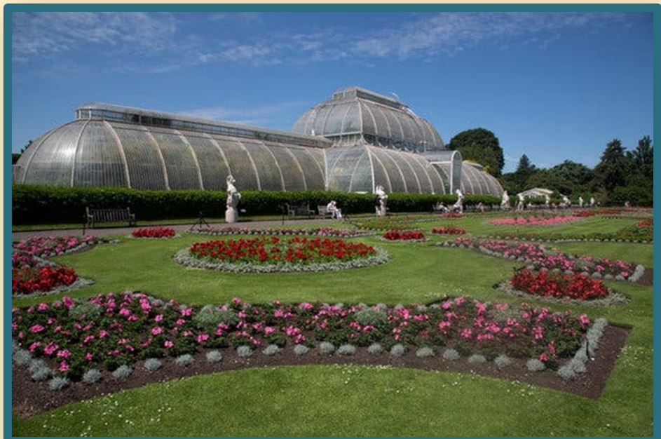
The Palm House at Kew Gardens in London.