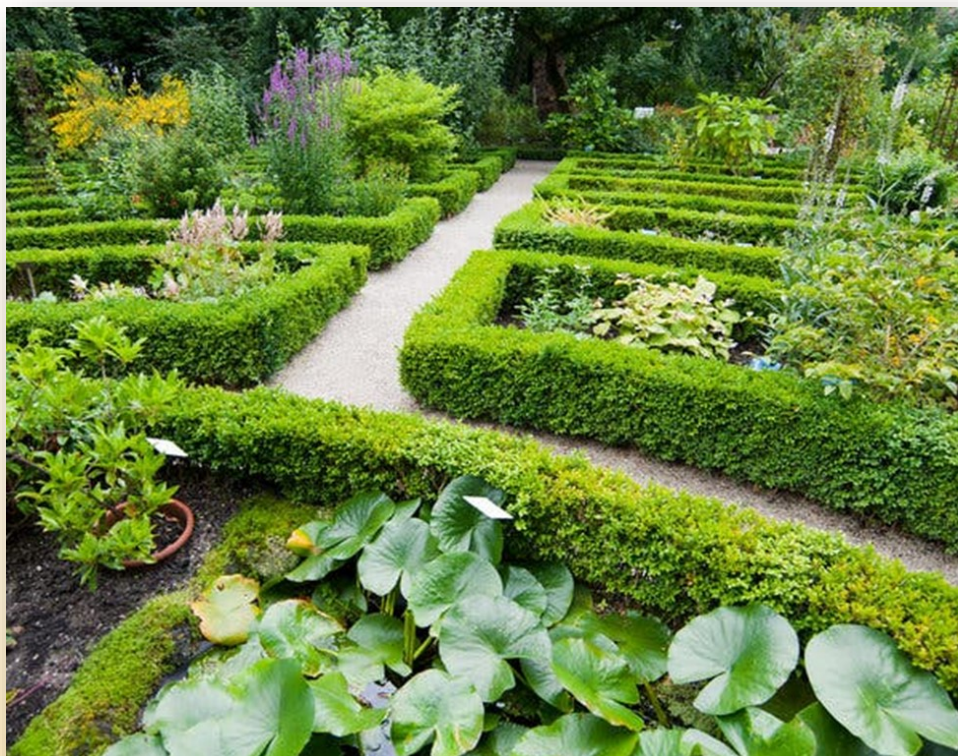
Hortus Botanicus in Amsterdam.

As a student at Oxford, I discovered with delight a very different garden — the Oxford Botanic Garden, one of the first walled gardens established in Europe. It pleased me to think that Boyle, Hooke, Willis and other Oxford figures might have walked and meditated there in the 17th century.